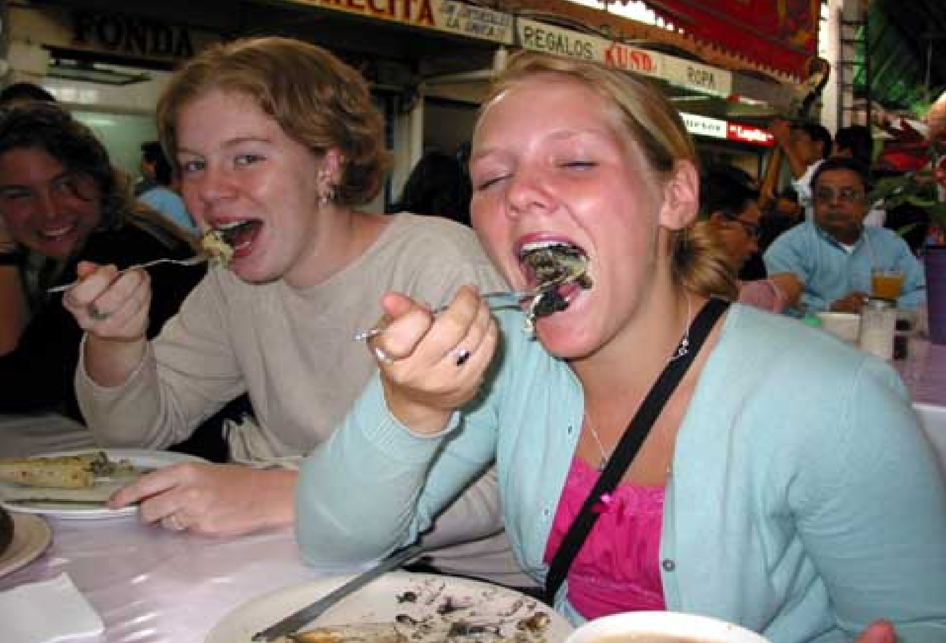
„Health“ food called Huitlacoche, an expensive Mexican speciality: Maize infected with Ustilago maydis , a fungus which produces dangerous fumonisin, internet source