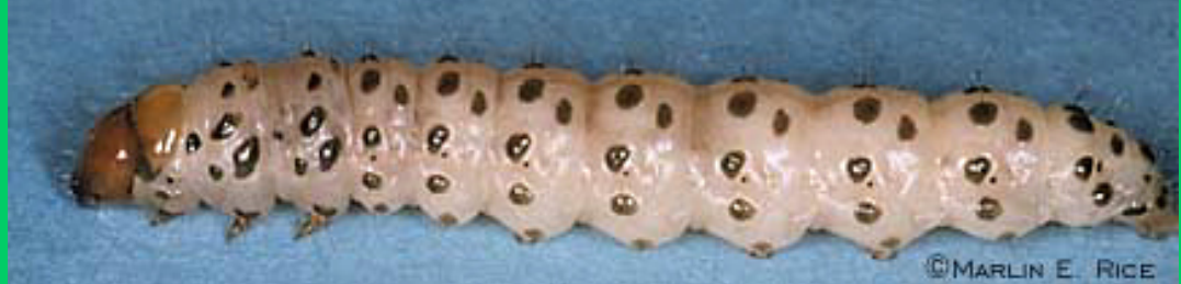
Southwestern corn borer larva