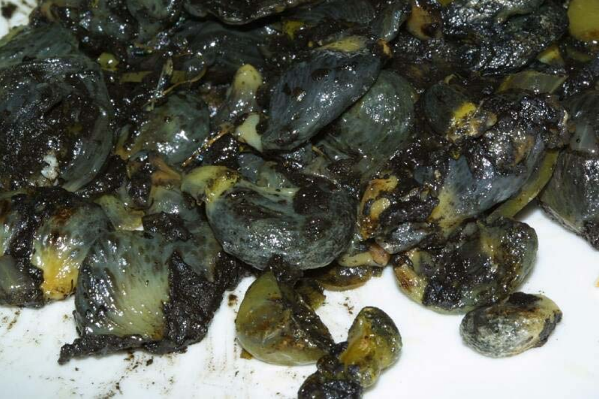
Huitlacoche on the dish in Mexico City 2002, a delicious speciality, Foto K.Ammann