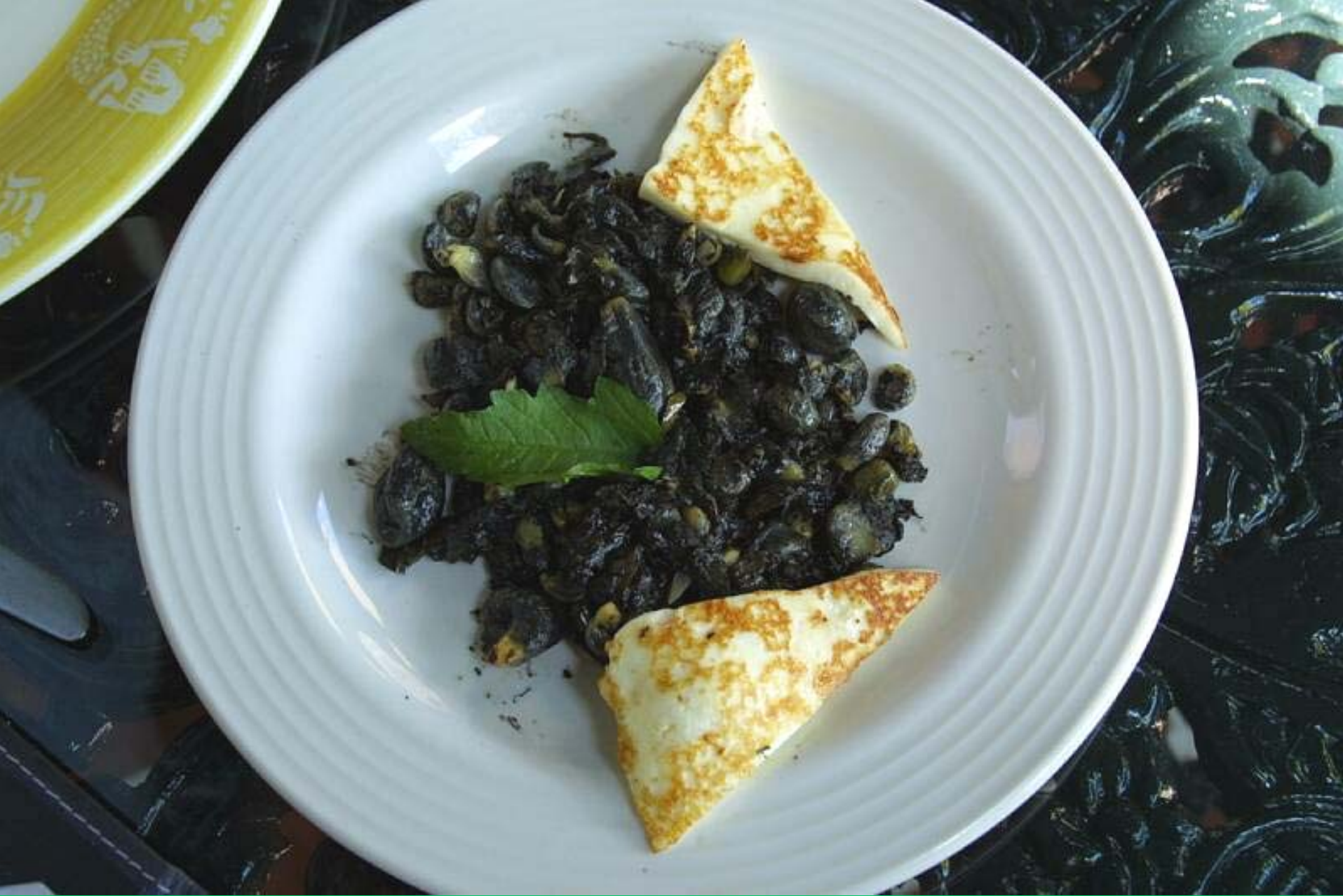
Huitlacoche on the dish in Mexico City 2002, a delicious speciality