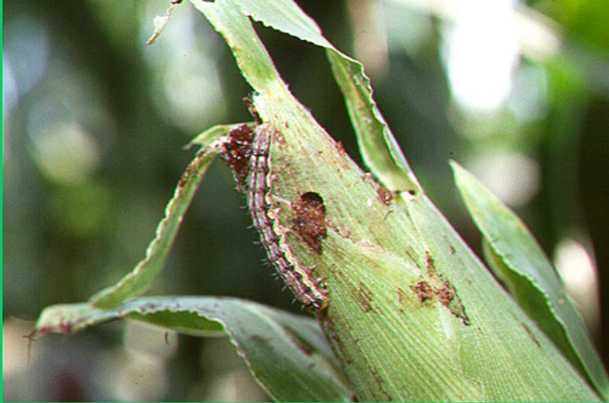
Corn earworm larva feasting on a corn ear