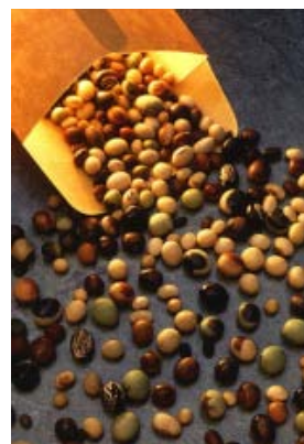
Soybeans were genetically engineered to make them herbicide resistant.

Information is scarce about health hazards, such as toxicity in genetically modified (GM) crops.