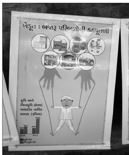
(Left) Package of “illegal” Bt seeds. Studies indicated that “more than half the transgenic cotton in India comes from illegal varieties.” (Right) Poster suggesting that nongovernmental organizations fall into the trap of paternalistically regarding Indian farmers as puppets rather than agents “negotiating new technology.” (Ronald J. Herring)

archical system of knowledge. Coalitions seek to keep strands together, even when there are contradictions across strands: if you are against globalization, you are against biotechnology. But for this construction to be accepted in India, activists had to make a radical discursive leap: farmers are assumed to have no capacity as active agents, but merely constitute passive victims. If that is so, the prior question is: Why should farmers be less able to take advantage of leaky global intellectual property rights (IPRs) than are people in other sectors? “Piracy” of computer software, for example, is rampant. Aggregate data from The Economist indicate that of business software in use in China, 92 percent is pirated; in Vietnam, 92 percent; in Ukraine, 91 percent, In Indonesia, 88 percent; Russia, 87 percent and so on. 23 Few people of my generation have paid for all the software we use. The phenomenon is general. In his book Illicit : How Smugglers, Traffickers and Copycats Are Hijacking the Global Economy , the editor of Foreign Policy , Moises Naim, argues that commonly observed illegal transactions are not isolated pockets of deviance, but are integrated with major currents of politics and economics on a global scale. Property systems are vulnerable to the agency of those who would create niches outside the scope and under the radar of states and firms. Why should the same dynamics that operate on the streets of Beijing and Delhi not apply to biotechnology in rural Bharat?